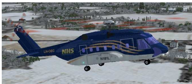
NHS (Norsk) Helikopter