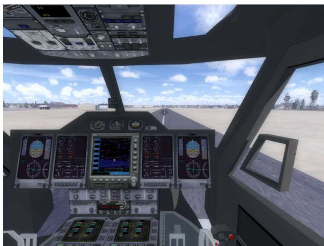
Virtual Cockpit View

The entire cockpit and cabin of the aircraft have been included in the aircraft models. The pre-programmed views follow: