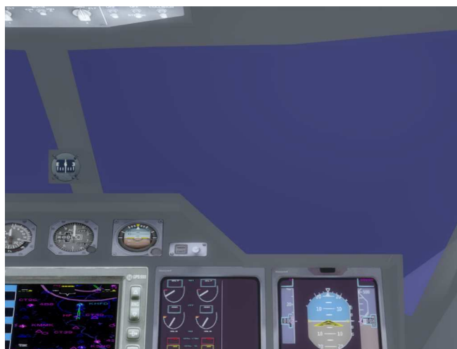
Virtual Cockpit Only