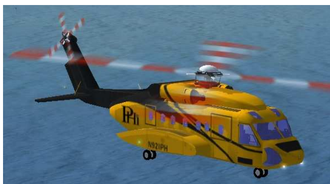
Petroleum Helicopters Inc. (PHI)

In addition, a paint kit showing the texture mapping and a version showing the helicopter in the primer finish during production are included in this package.